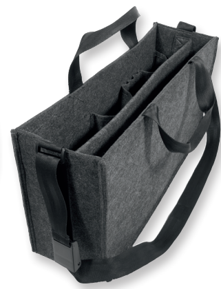
BA411 dark grey (50x28x15 cm)