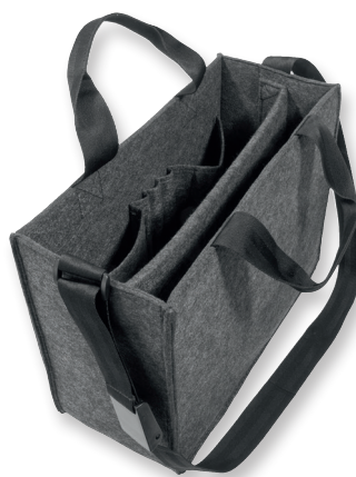
BA410 dark grey (36x28x15 cm)