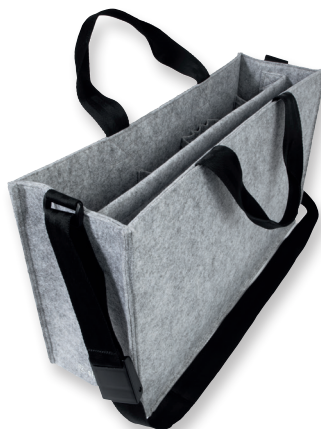
BA409 light grey (50x28x15 cm)