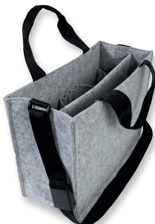
BA408 light grey (36x28x15 cm)