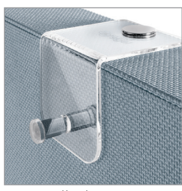
SB700 Flipchart hooks

We recommend using the Sound Balance accessories in combination with SIGEL brand writing and cleaning products, e.g. whiteboard markers (prod. code (MU180/181), cleaning spray or cloth (prod. code MU200, MU202) and pins (prod. code MU190).