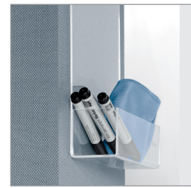
SB720 Storage box