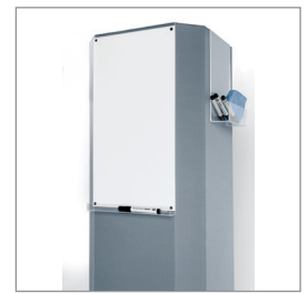
SB710 Writing panel